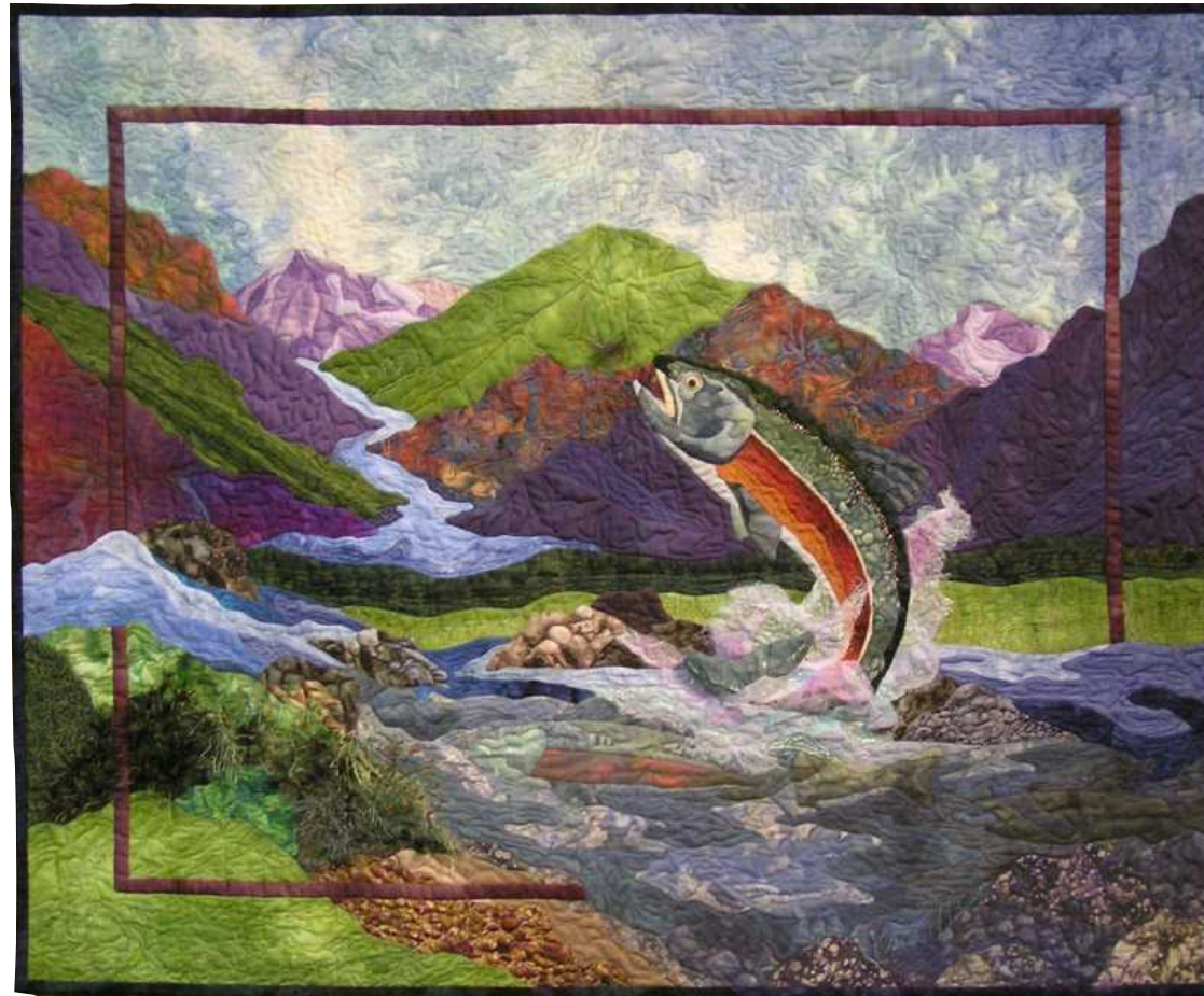
River Dance, 37.5" x 30.5" Carol Seeley (Campbell River, BC)