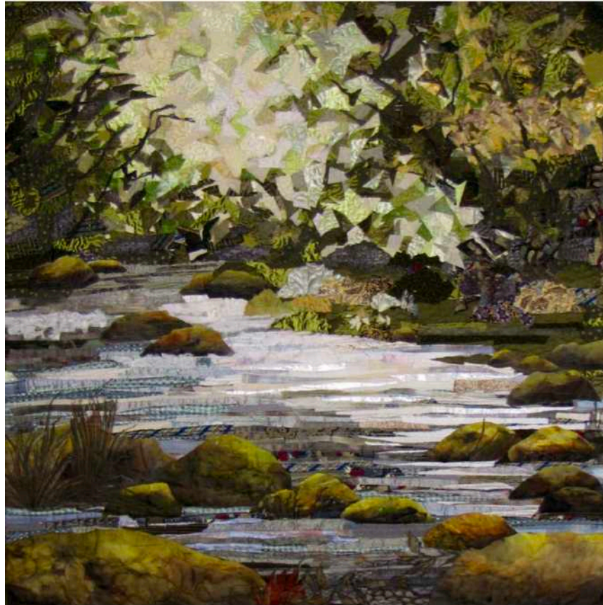
Finding Tranquility, 45" x 45" Karen Thatcher (Rossland, BC)