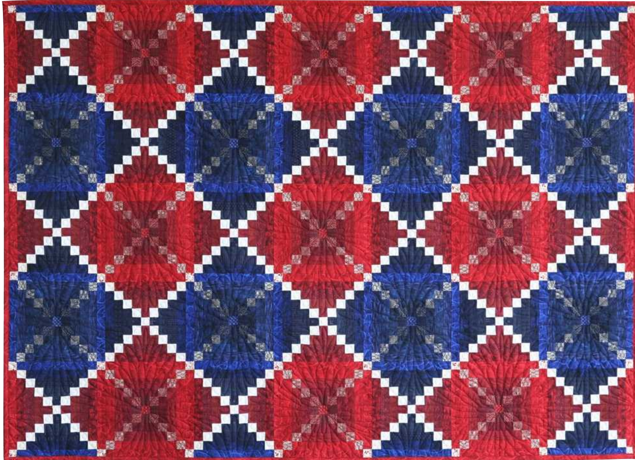
Blood is Thicker Than Water, 67" x 48" Tracey Lawko (Toronto, ON)