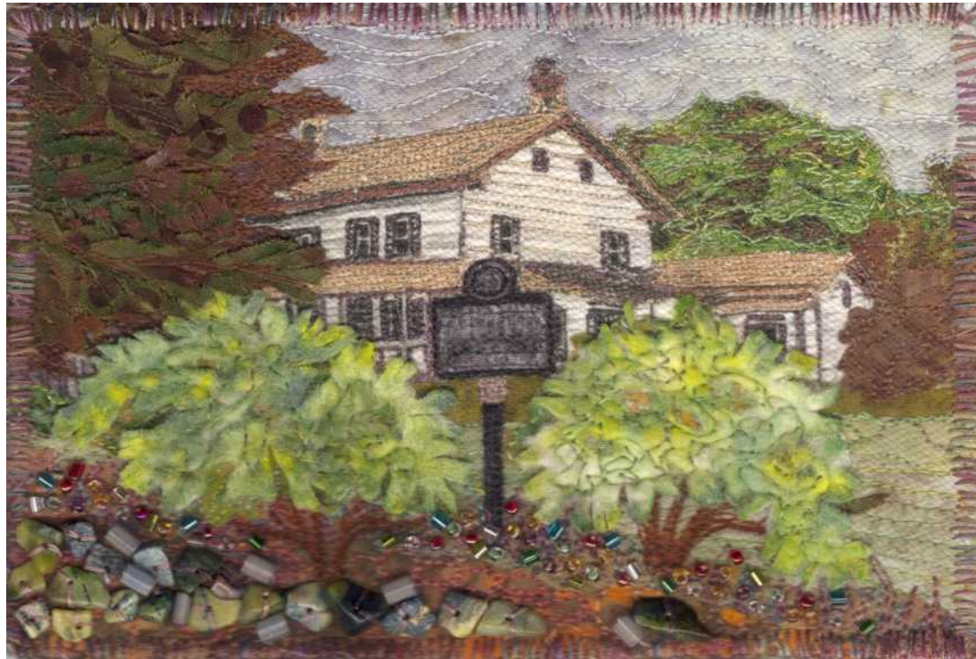
Joseph Schneider Haus, 4" x 6"