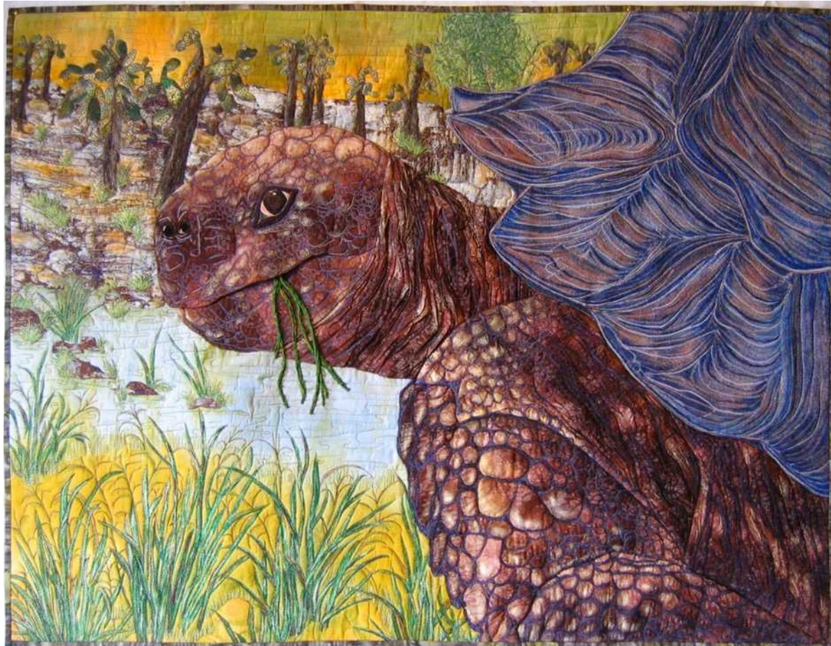
Resident Relic, 47.5" x 34.5"