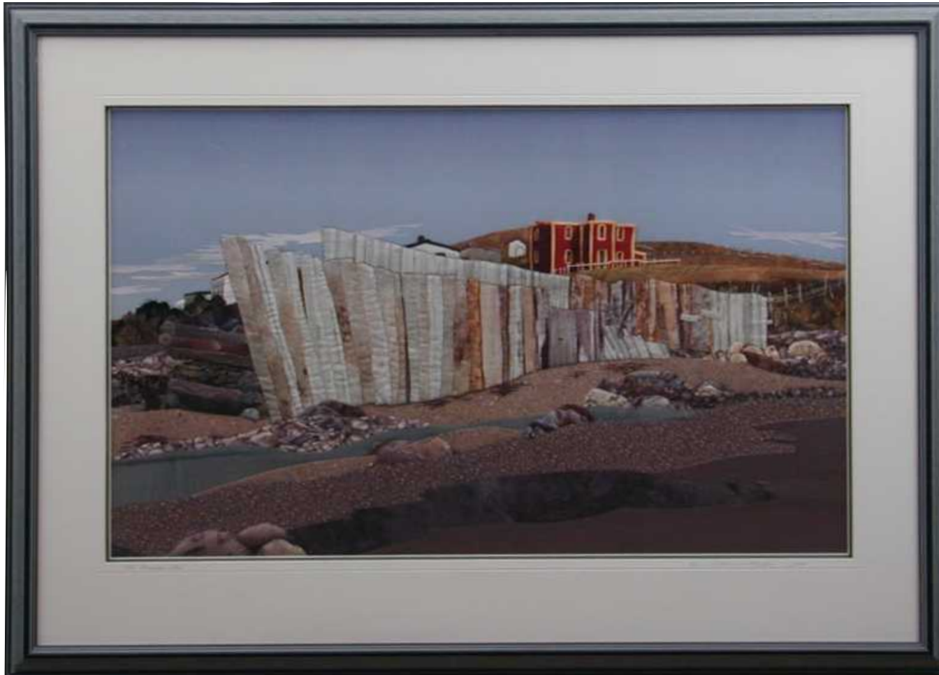
Breakwater, Ferryland, Southern Shore, Newfoundland , 34" x 23.5"