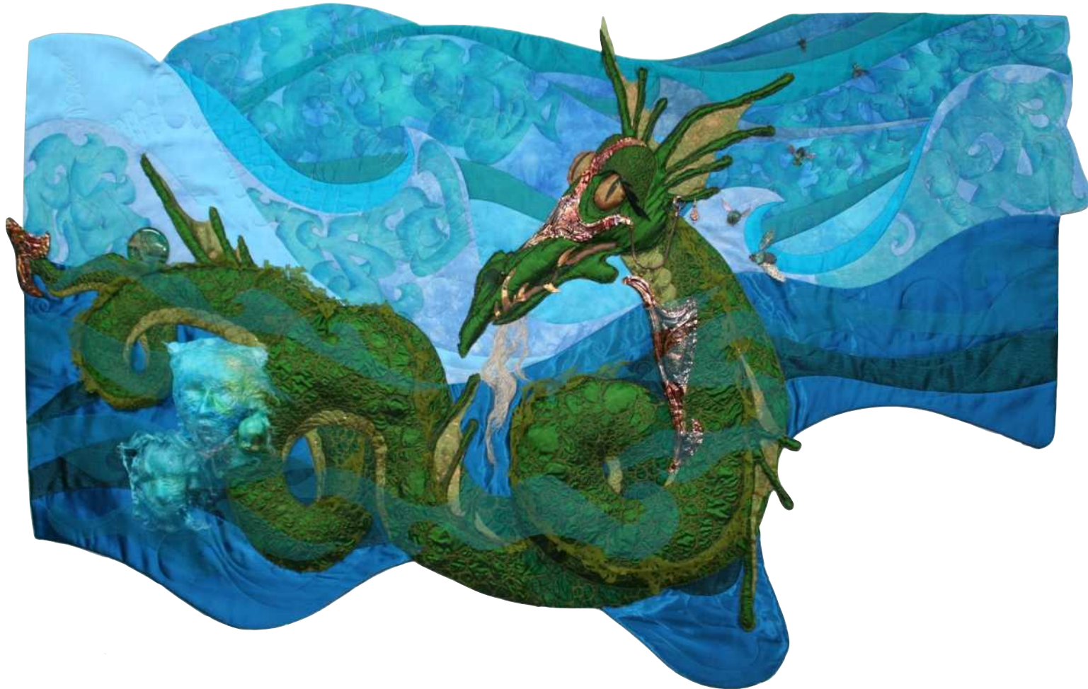
Ethlyndryal the Protector, 58.25" x 35.75"