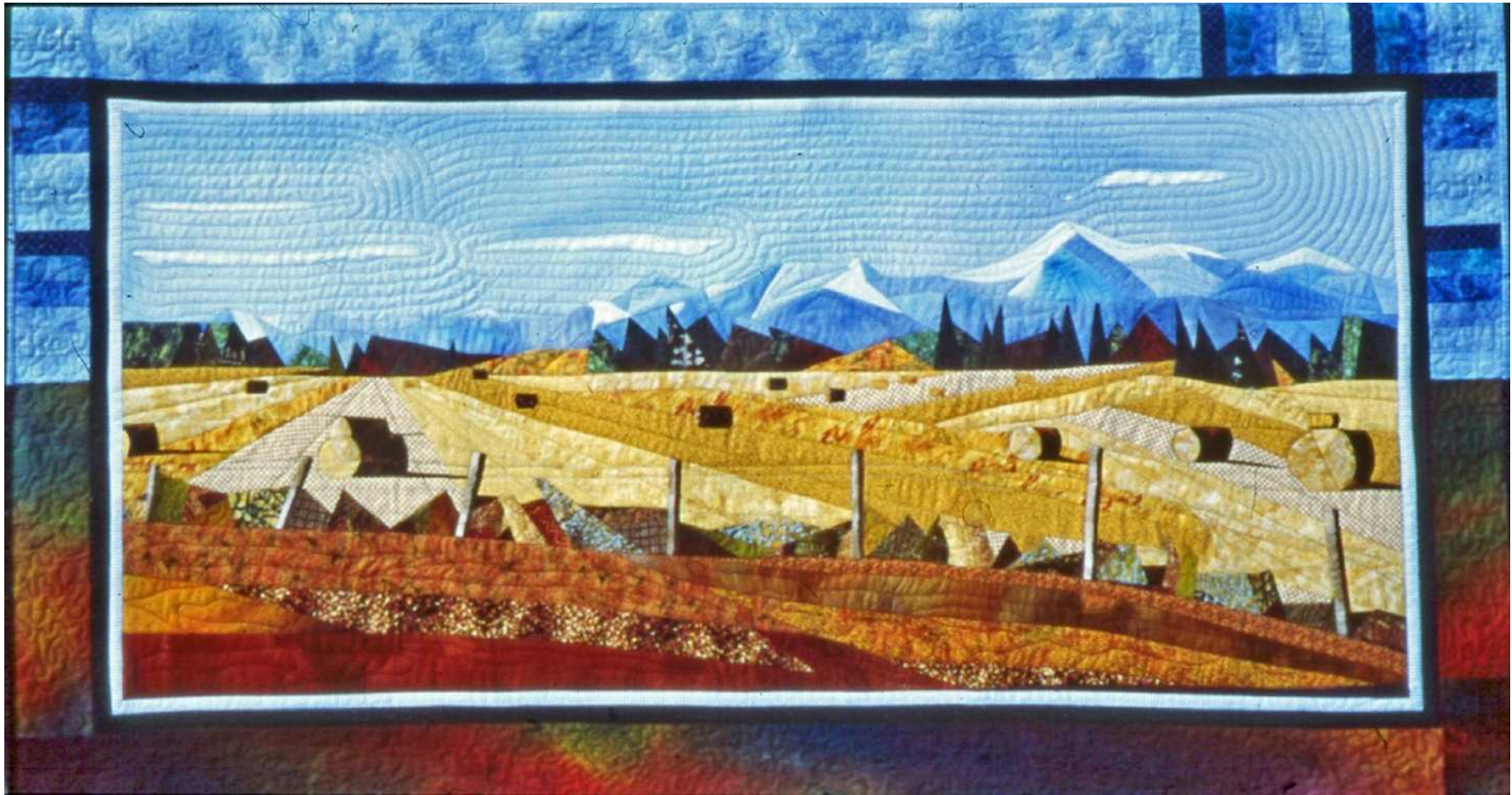
Reflections of the Harvest, 59"x31"